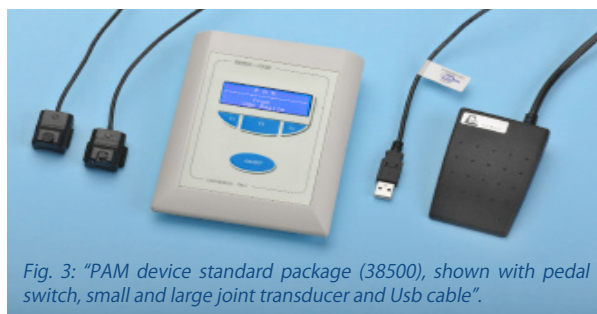
Fig. 3: "PAM device standard package (38500), shown with pedal switch, small and large joint transducer and Usb cable".

Electronic Unit: the compact PAM controller connects to the mains or can be battery-operated. A foot pedal switch is provided for manual score of the peak force.