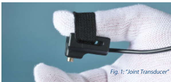
Fig. 1: "Joint Transducer"

Pressure transducers: the PAM device comes with 2 transducers, each tested and validated. Both flat and round, the large transducer is suitable for rat, the small one is ideal for mouse.