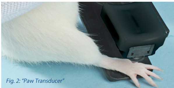
Fig. 2: "Paw Transducer"

An optional paw transducer/applicator is also available, rapidly transforming the PAM into a Digital Randall-Selitto for pressure application on paws, muscles, tail.