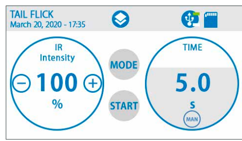
USB key to export csv data to PC