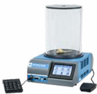
Hot/Cold Plate SKU 35300