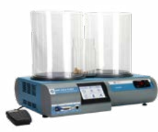
Thermal Place Preference SKU 35350