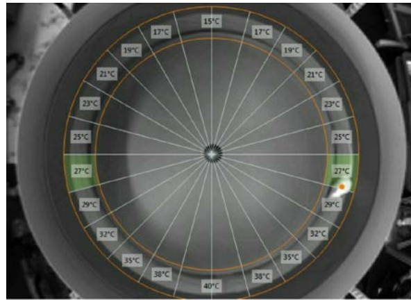
ANY-Maze Video-tracking software automatically analyses thermal preference and avoidance parameters. A dedicated (TGR limited) ANY-Maze software version is available at a lower price than the ANY-Maze full version and also includes TGR protocol ready to use.