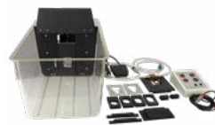
Orofacial Stimulation Test SKU 31300