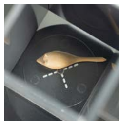
Plantar Test for Thermal Stimulation SKU 35750