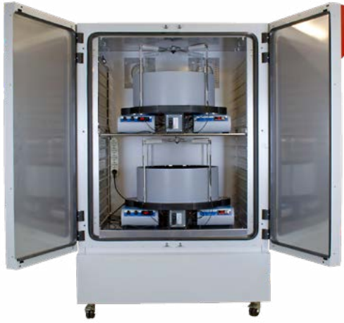
Temperature controlled cabinet (-10/+100 °C range temperature) to hold up to two Thermal Gradient Rings under constant temperature and sound isolation, to be not depending on of the lab room temperature (optional item).