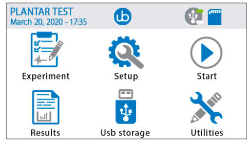
USB key to export csv data to PC