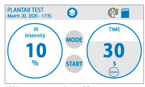
USB key to export csv data to PC