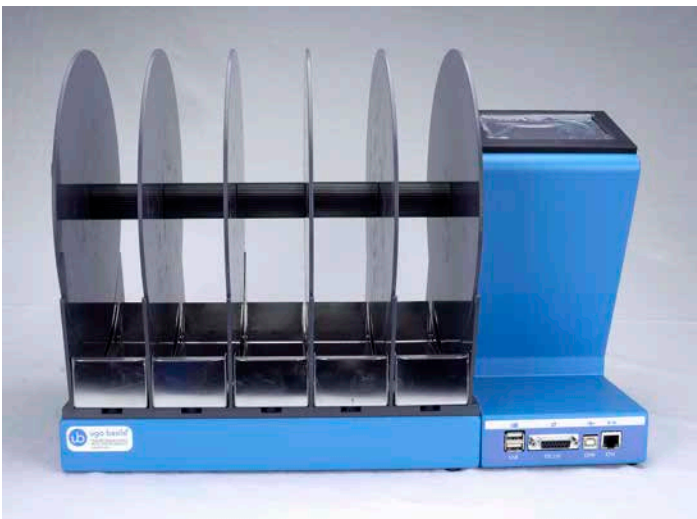
Mice RotaRod with standard rod (no Rod enlargers installed)

Every time You use and detach the Rod enlargers from the mice RotaRod, please be sure to clean it using water and a disinfection solution to avoid dirt and smell of previous used animals.