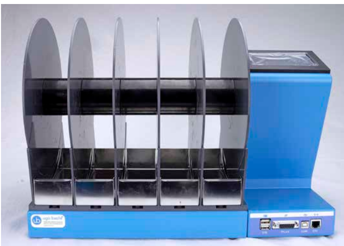
Mice RotaRod with standard rod (Rod enlargers installed)