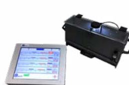
Active Avoidance Product Code: 40532/40533