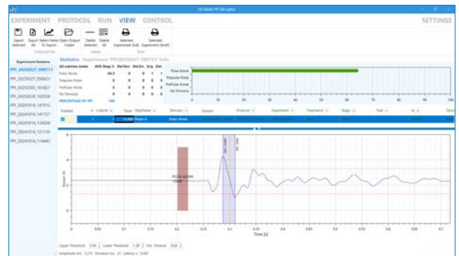
View of the experiment results via the dedicated software interface.