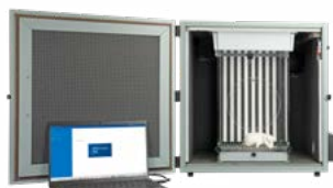
Fear Conditioning System Product Code: 46101/46101-4