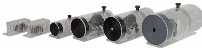
Different animal holders to match animal dimension. From left to right: Mouse Holder small (SKU 48003-320), Mouse Holder large (SKU 48003-321), for rodents up to 100gr (SKU 48003-360), for rodents up to 250gr (SKU 48003-370), for rodents up to 450 gr (SKU 48003-390), for rodents up to 800gr (SKU 48003-380).