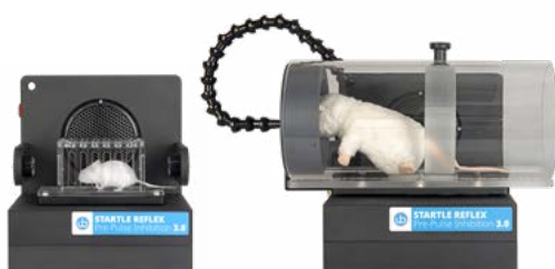
Two stimulating/Recording available: one for mouse, one for rat.