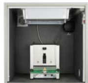
Activity Cage Product Code: 49603