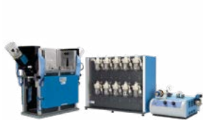
OPERON Product Code: 49500/49503